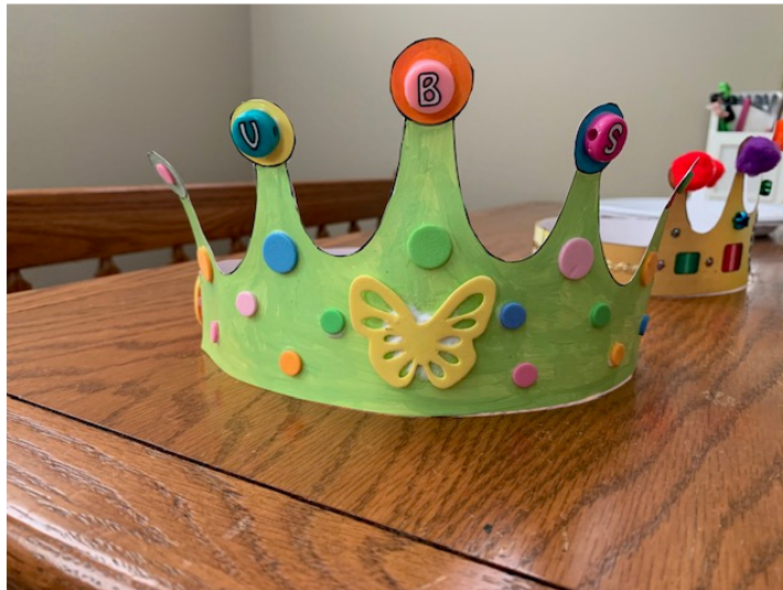
Paints and goodies

Here are a few finished crowns to give you some ideas.