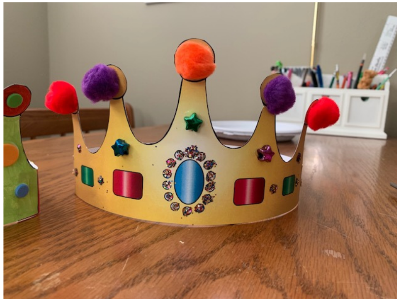
Printed and added glitter, pompoms and beads